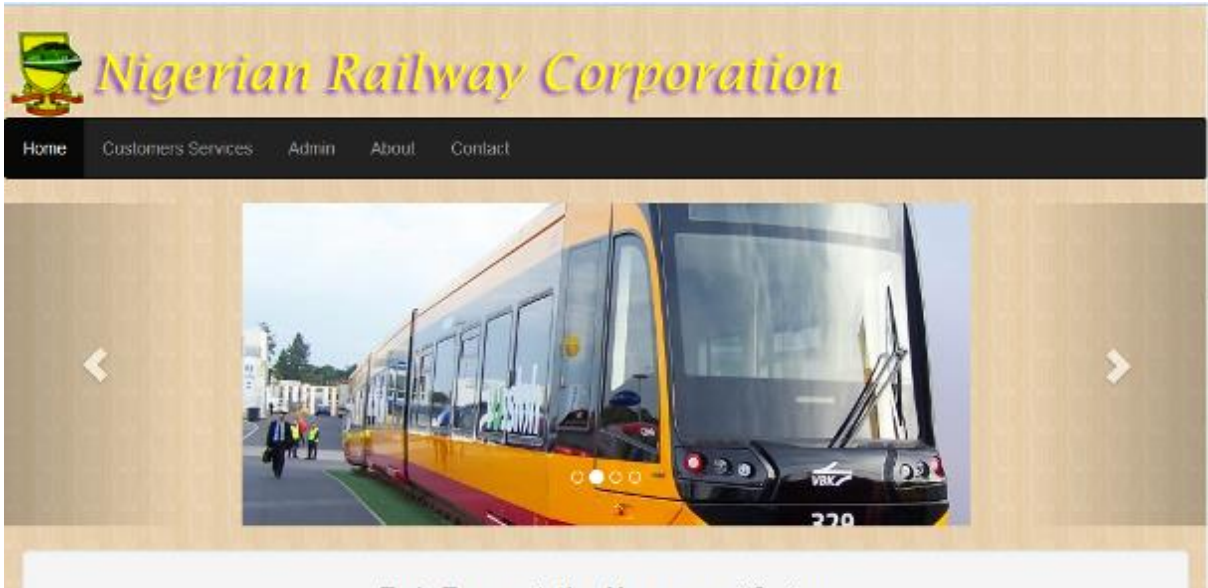
Train Transportation Management System